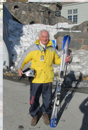
"Skiers live a long time. THANK YOU, Timberline!"